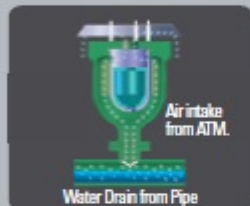
Activation 2 Vacuum Relief